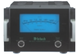
MC1201 MONOBLOCK POWER AMP

Academy Series Loudspeakers. The Academy speakers satisfy the often contradictory demands of pure music versus movie sound. All Academy loudspeakers use the acclaimed LD/HP® driver – which significantly reduces bass distortion while increasing power handling. The compact HT5 has a footprint less than 10 inches square. The LS320, LS340, and LS360 feature arched bridge truss construction that is virtually immune to vibrations that distort sound. A special tweeter plate in the LS320 and LS340 reduces edge diffraction cancellation, while the five tweeters in the LS360 are wired in a Bessell Function array that acts as a point source. The WS320 is the wall-mount sibling of the LS320 and comes in a paintable white finish. At 400 watts, the PS112 is McIntosh's most powerful amplified subwoofer. It features arched bridge truss construction and a black glass control panel.